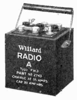
Capacity and prices of this new battery—the Willard F W are as follows: 40 a. h., $13.60; 80 a. h., $17.50; 110 a. h., $22.00. Prices slightly higher west of the Mississippi and in extreme south.

It's a through-and-through Willard at the lowest price a Willard Radio "A" Battery has ever been offered.