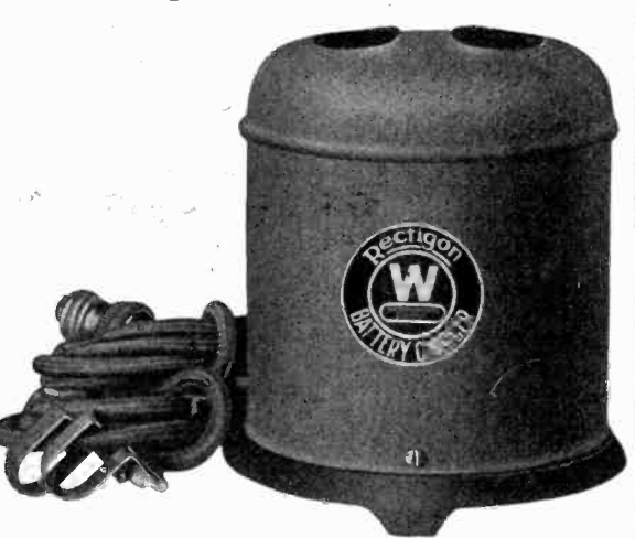
Westinghouse Electric & Manufacturing Co. East Pittsburgh, Pa.

Member of Radio Section Associated Manufacturers of Electrical Supplies